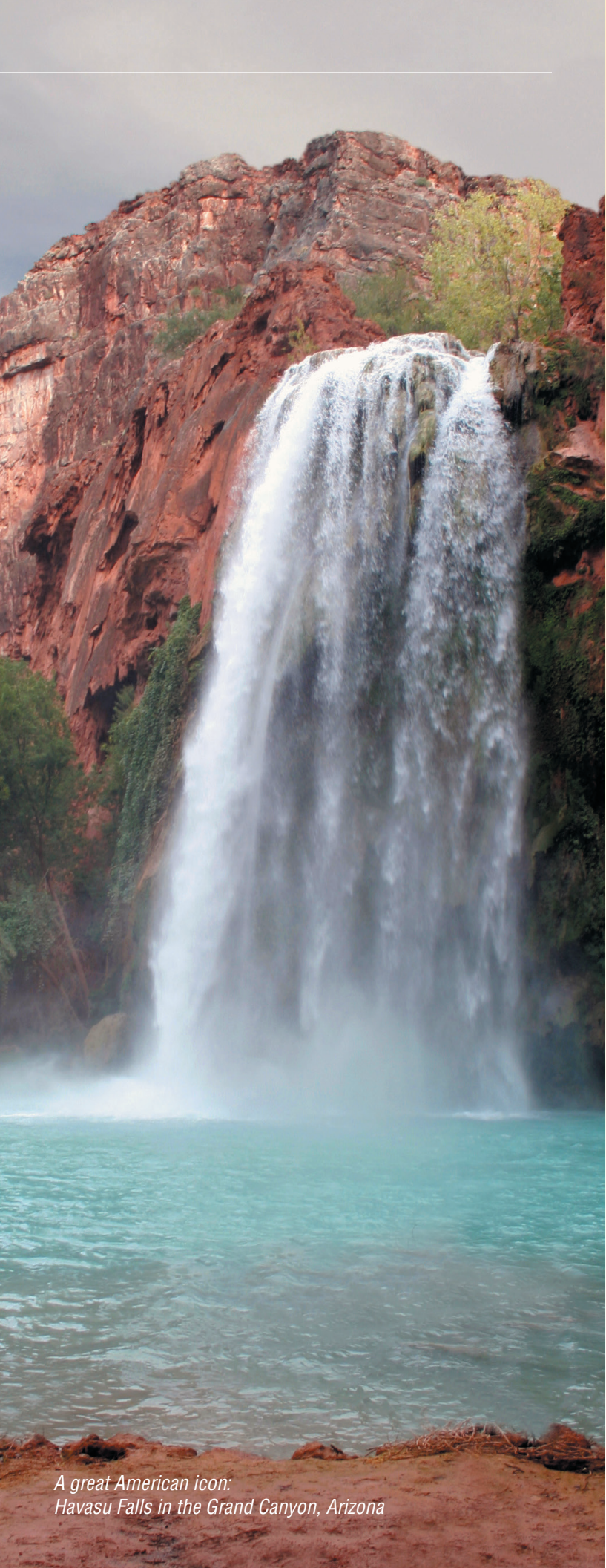
A great American icon: Havasu Falls in the Grand Canyon, Arizona