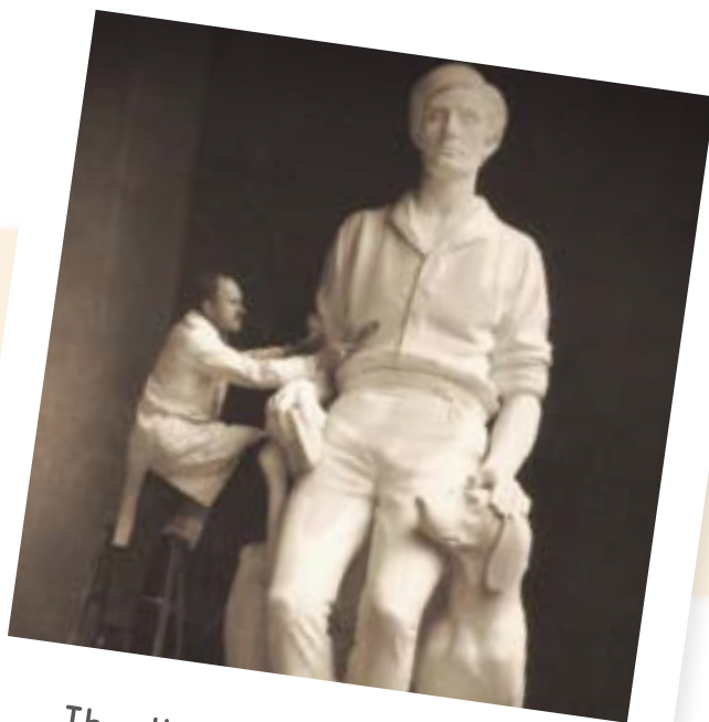
The Hoosier Youth, 1932

This bronze sculpture was commissioned by Lincoln National in 1928 and completed in 1932. The artist, Paul Manship, chose to portray Abraham Lincoln as a young man because he had spent 14 years of his youth in Indiana.