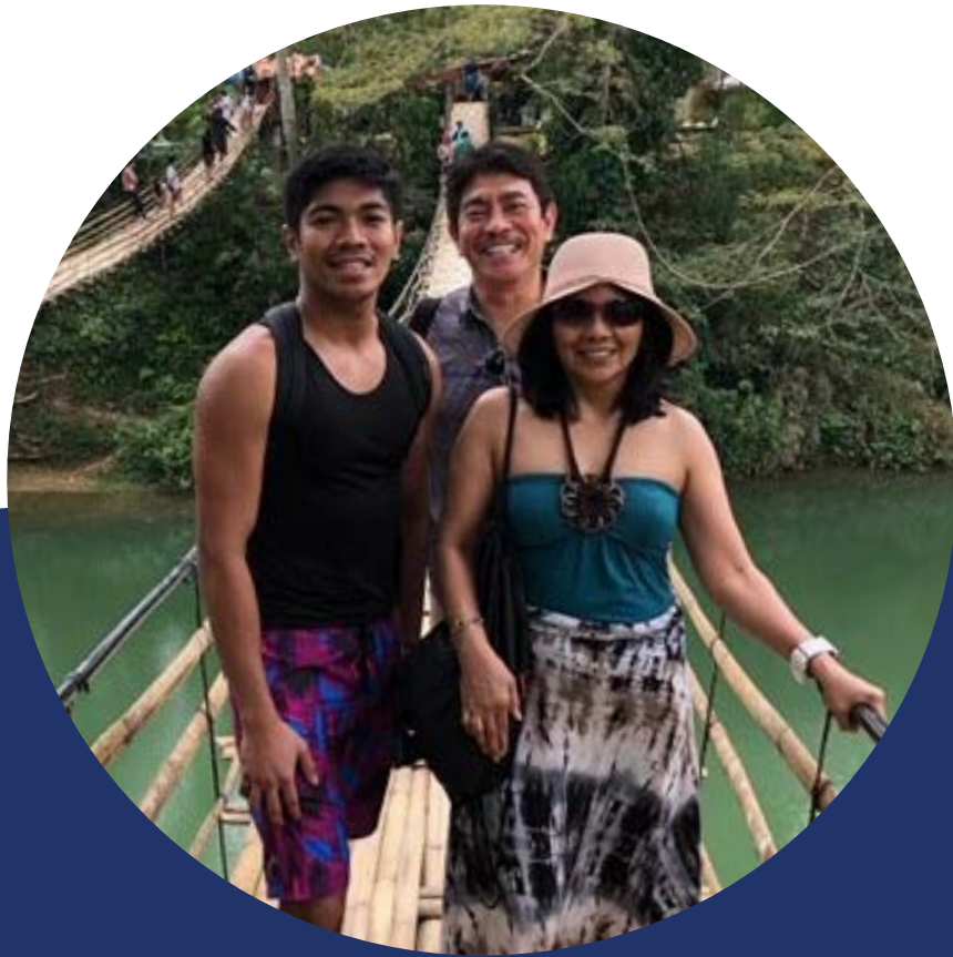
Photo submitted by Imelda from New Jersey , valued annuity customer since 2020 .