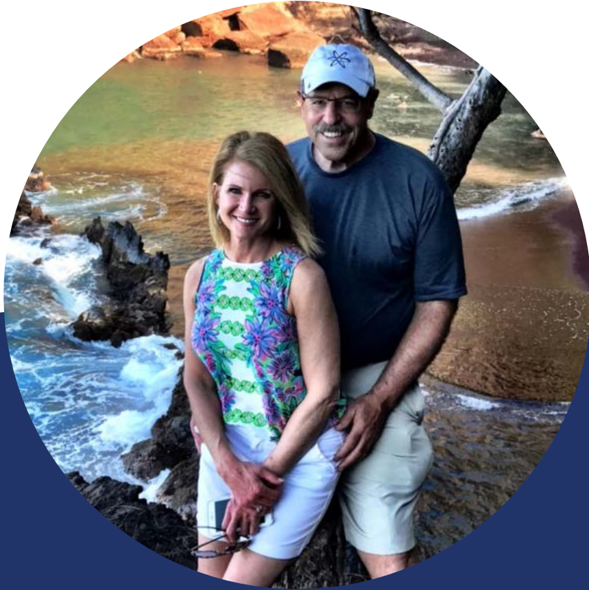
Photo submitted by Gregg from Connecticut , valued annuity customer since 2015 .