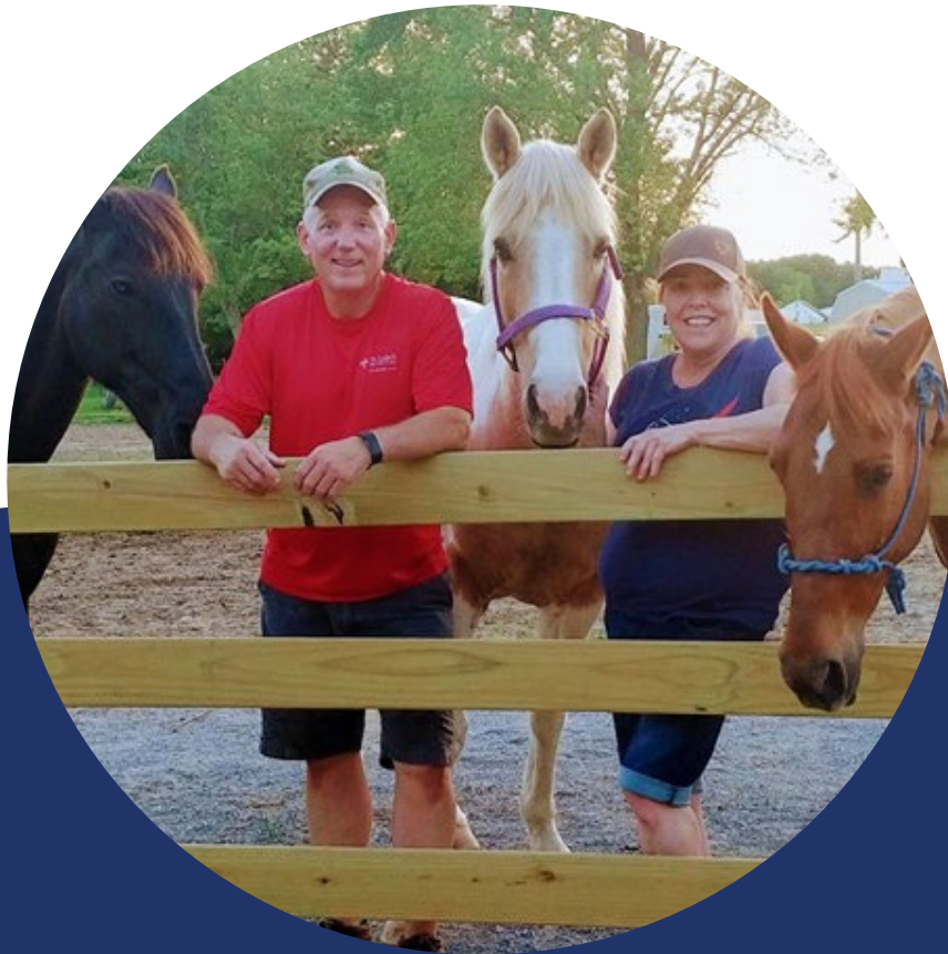
Photo submitted by Harriet from Missouri , valued annuity customer since 2016 .