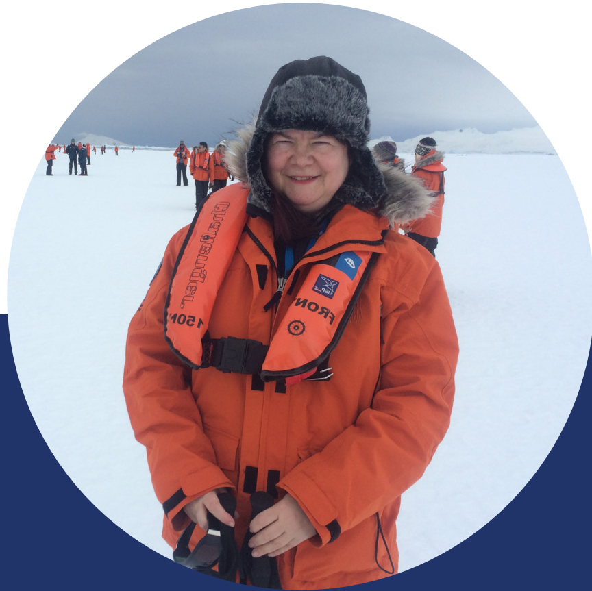
Photo submitted by Rebecca from Ohio valued annuity customer since 2001 .