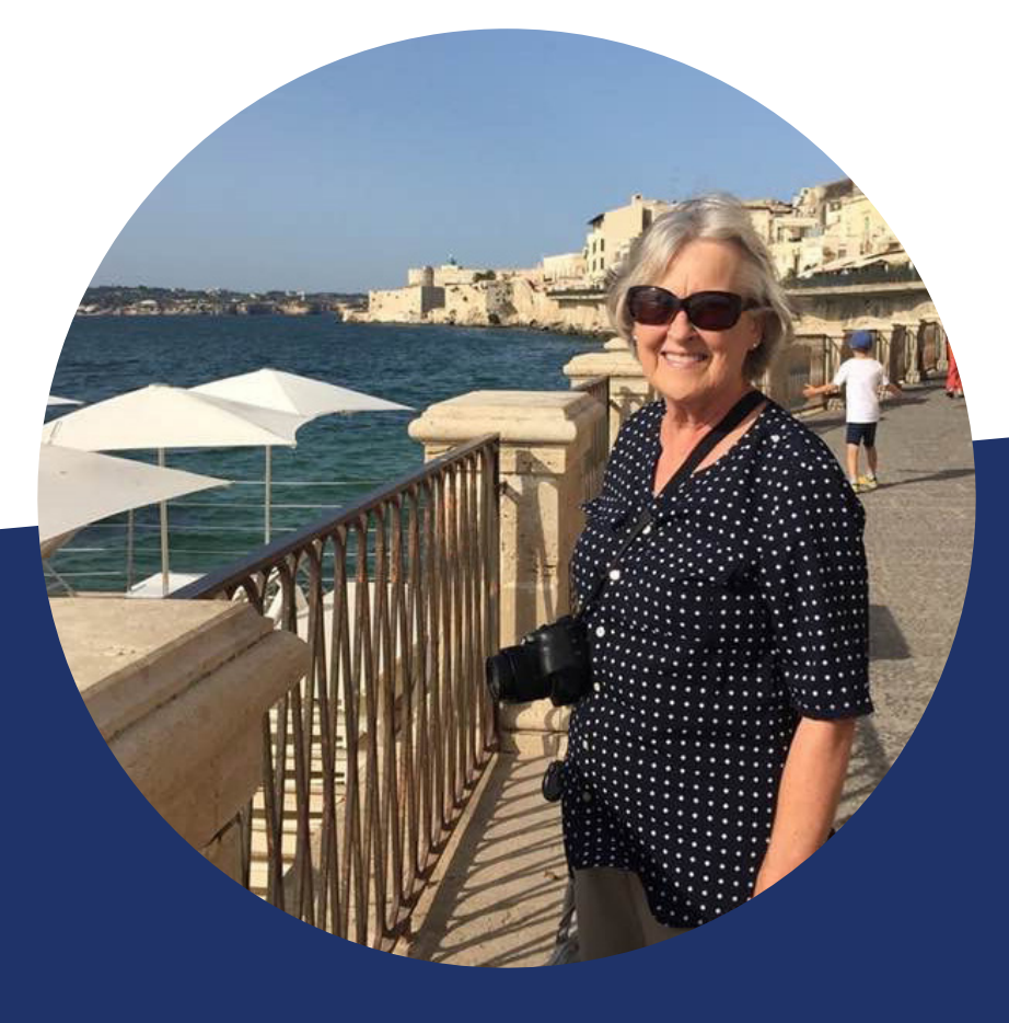
Photo submitted by Cheryl from Connecticut , valued annuity customer since 2016 .