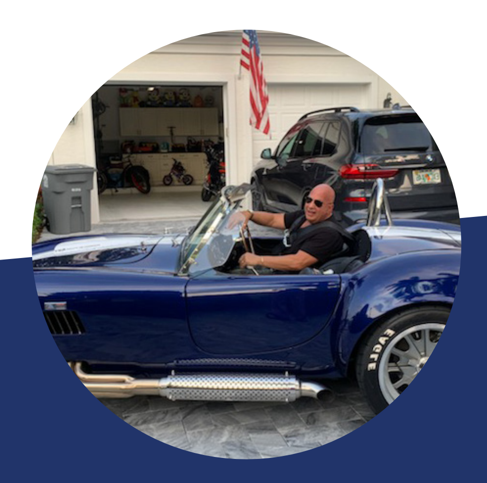
Photo submitted by Greg from Florida , valued annuity customer since 2018 .