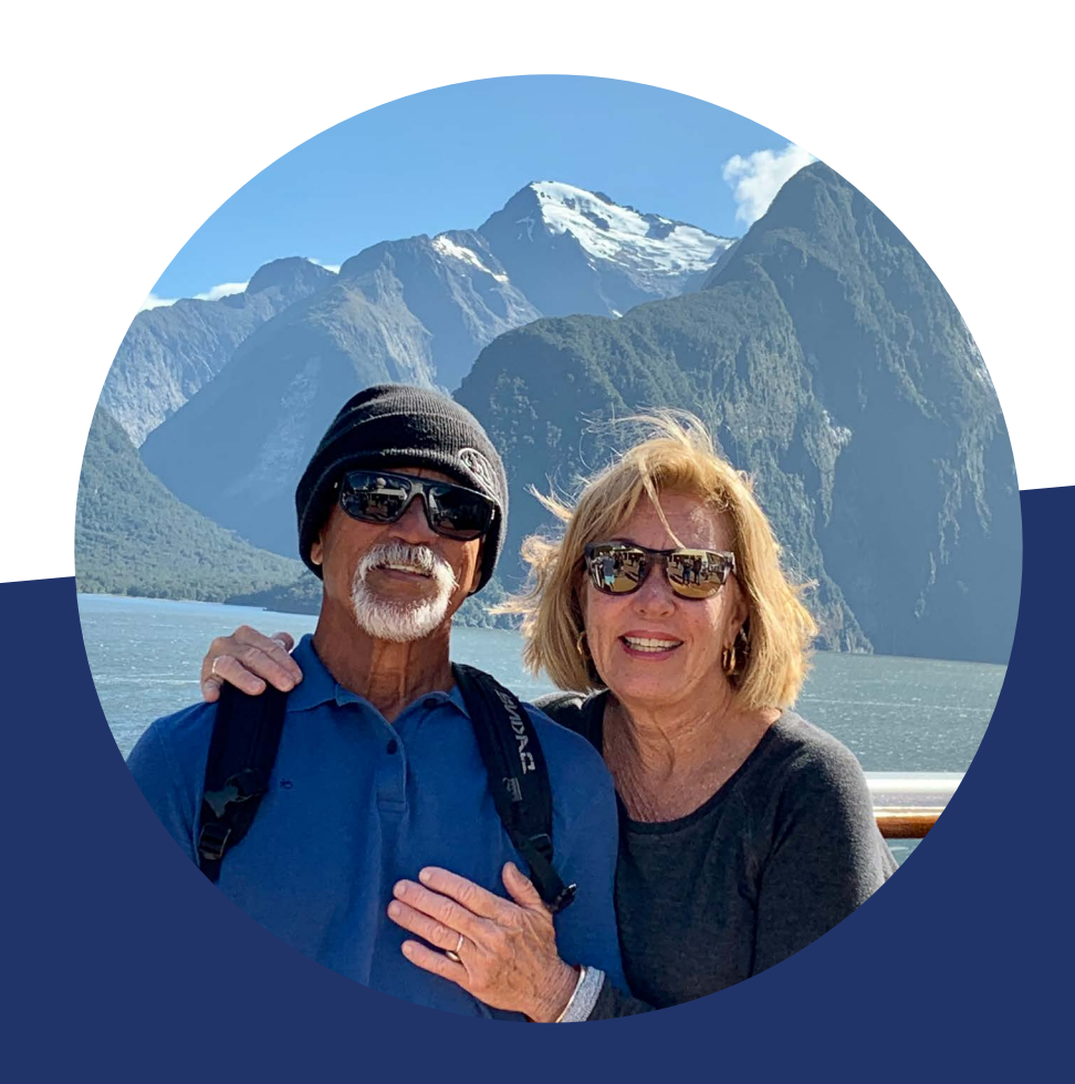
Photo submitted by Leroy from Hawaii , valued annuity customer since 2017 .